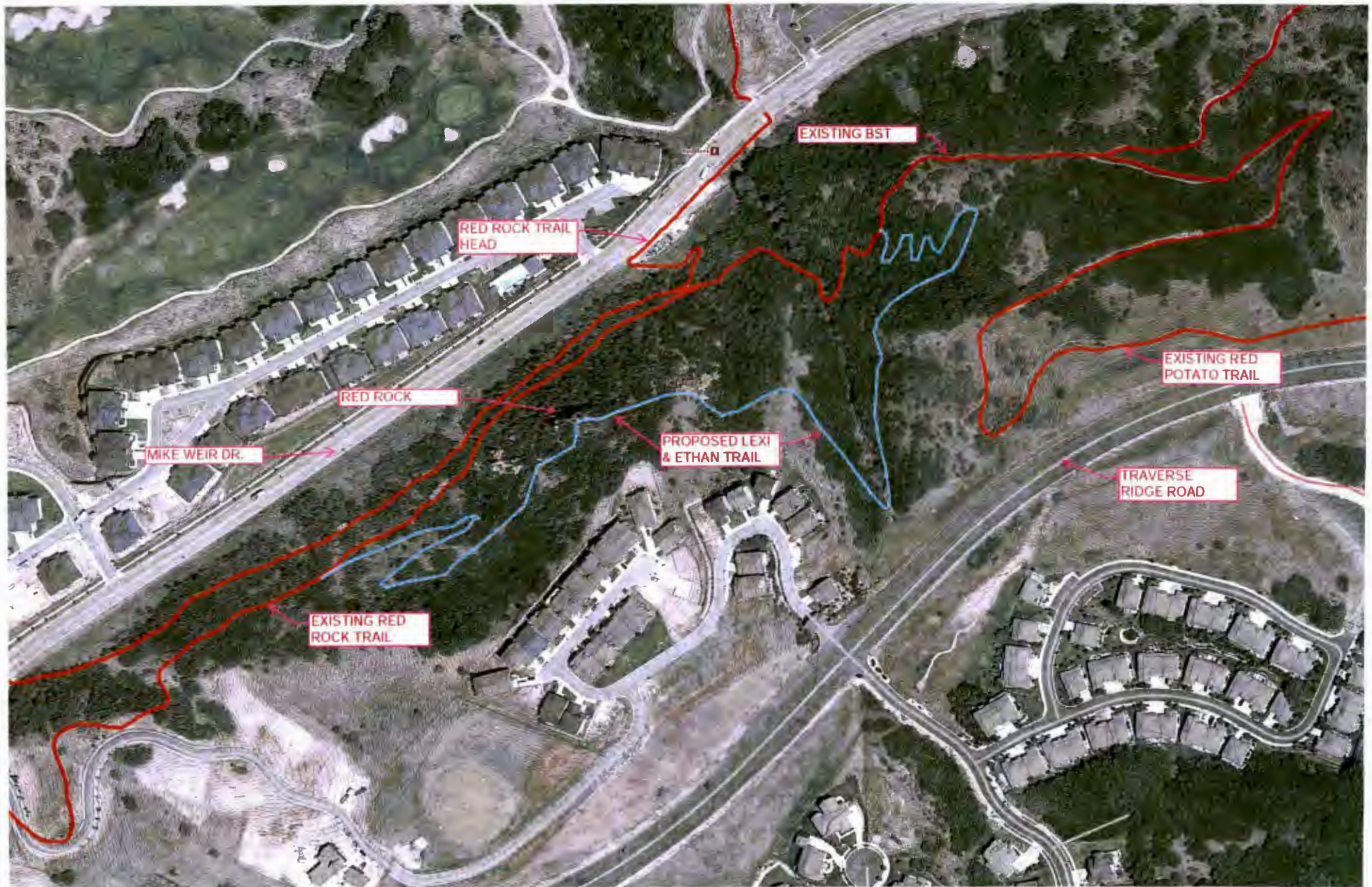
EXHIBIT 1 PROPOSED TRAIL ALIGNMENT FOR THE "LEXIE AND ETHAN TRAIL"